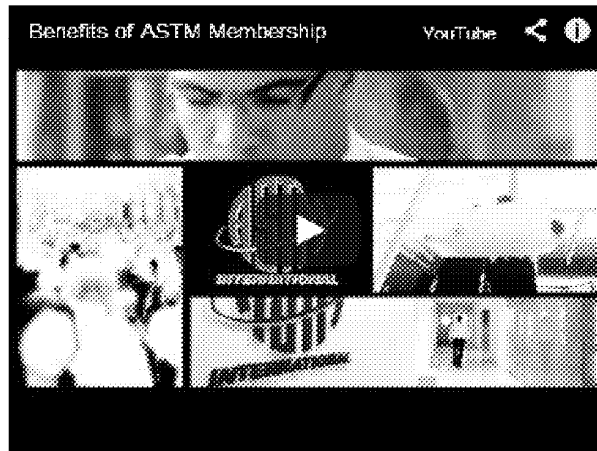
See all ASTM ind. videos on YouTube

Watch this short video to learn more from members on their ASTM experience!